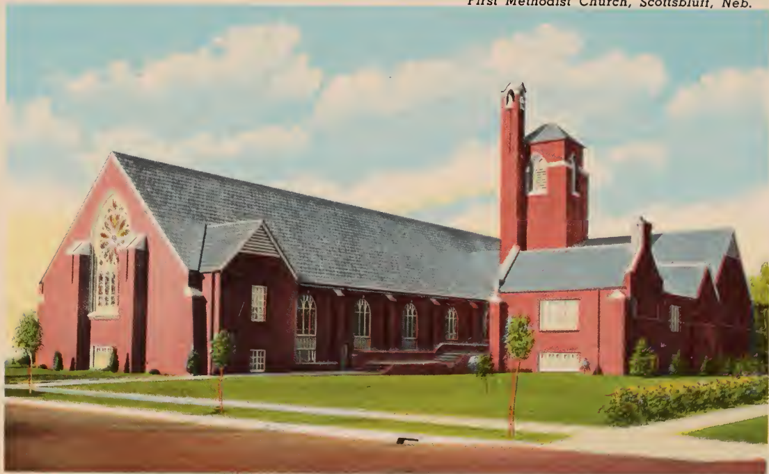
First Methodist Church, Scottsbluff, Neb.